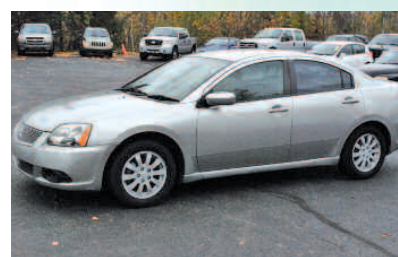
2011 MITSUBISHI GALLANT AS LOW AS $199/MO.