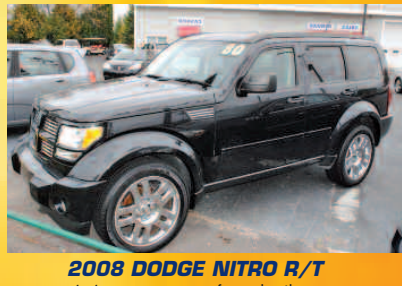
4x4, power sunroof, navigation, 3rd row seat, leather AS LOW AS $219/MO.