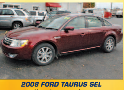
Very clean, very nice.