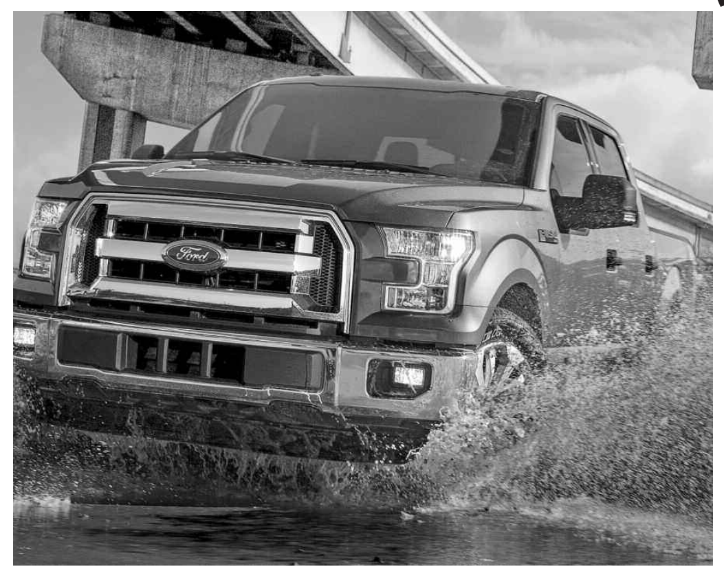
Ford, America's truck leader, continues its relentless pace of innovation and performance, helping customers get better mileage out of each gallon of gas in the 2017 Ford F-150.

In addition, F-150 customers benefit from improved acceleration,